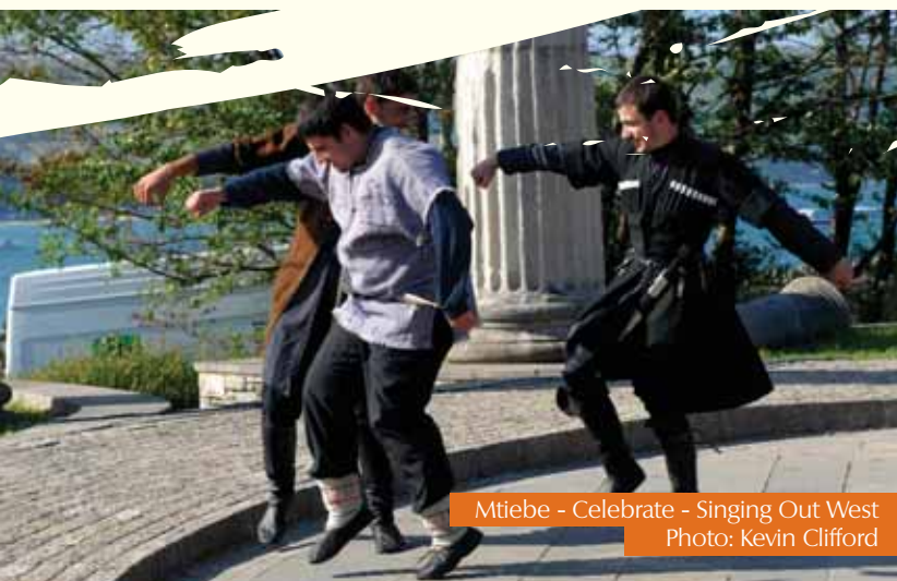
Mtiebe - Celebrate - Singing Out West