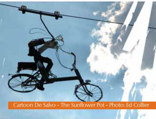
Cartoon De Salvo - The Sunflower Pot