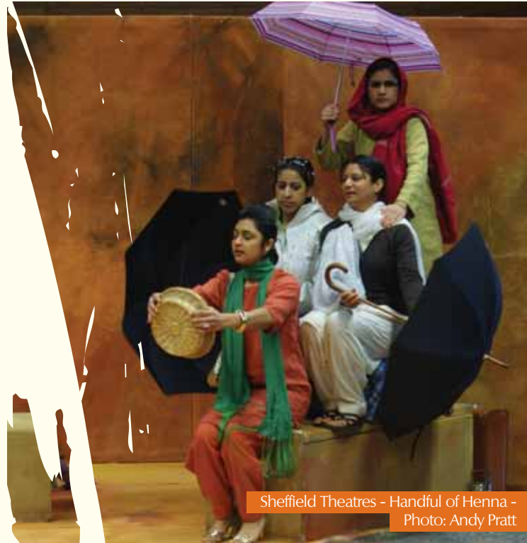
Sheffield Theatres - Handful of Henna

Future plans include extending early years touring, continuing with our international work and developing work with urban communities.