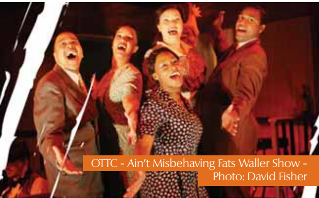
OTTC - Ain't Misbehaving Fats Waller Show