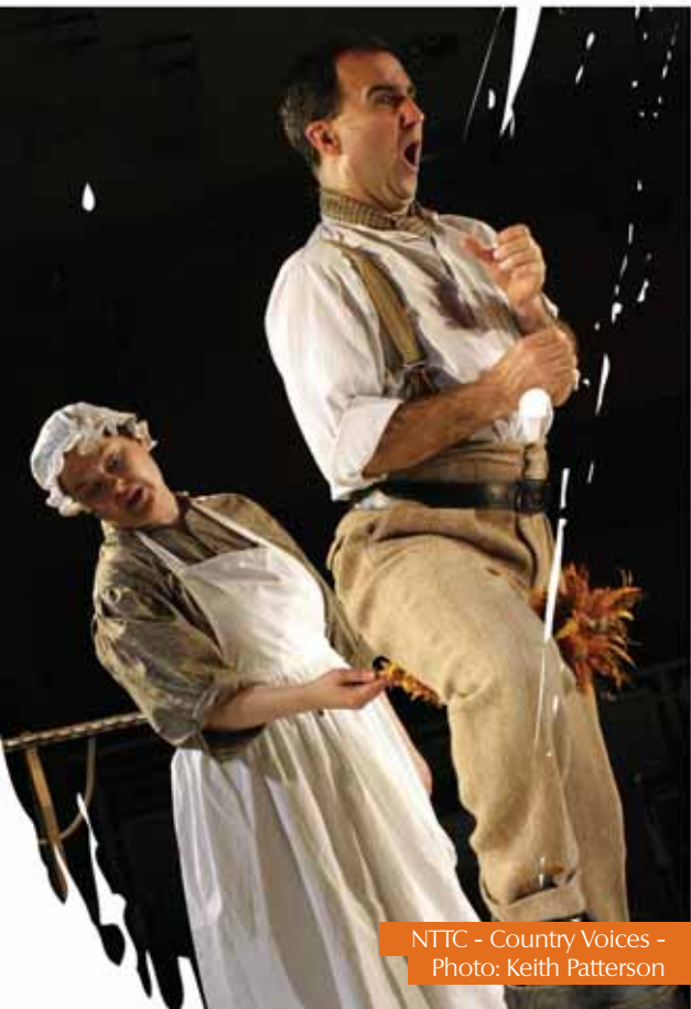
NTTC - Country Voices

“For me as an artist, it allows me to perform at my relaxed best in a very intimate setting, to a very welcoming group of people. I feel that these performances build on my existing strengths and add to my abilities.”