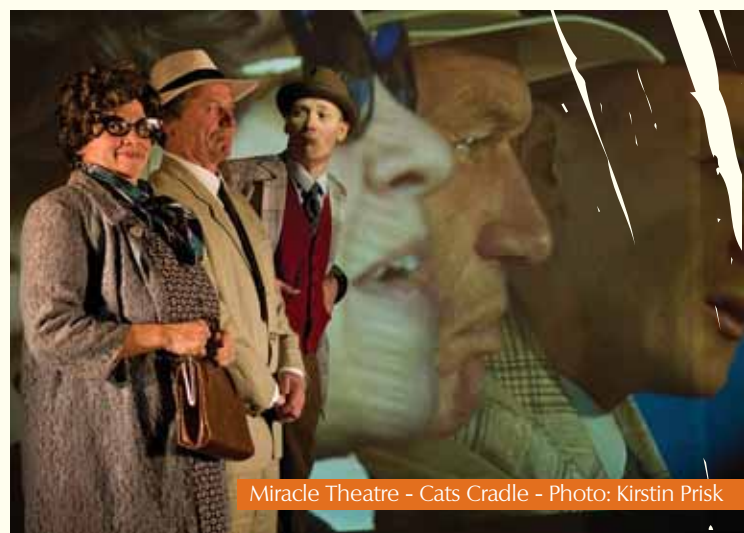
Miracle Theatre - Cats Cradle - Photo: Kirstin Prisk