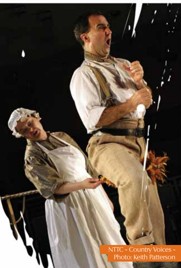
NTTC - Country Voices

"For me as an artist, it allows me to perform at my relaxed best in a very intimate setting, to a very welcoming group of people. I feel that these performances build on my existing strengths and add to my abilities."