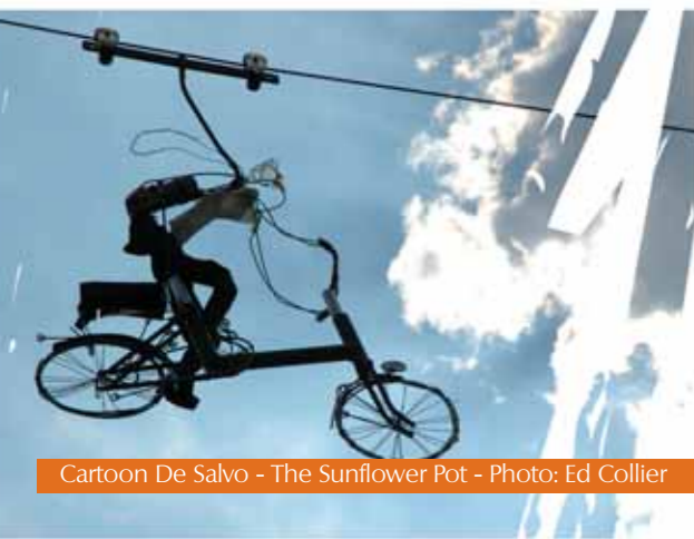
Cartoon De Salvo - The Sunflower Pot