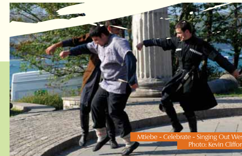
Mtiebe - Celebrate - Singing Out West - Photo: Kevin Clifford