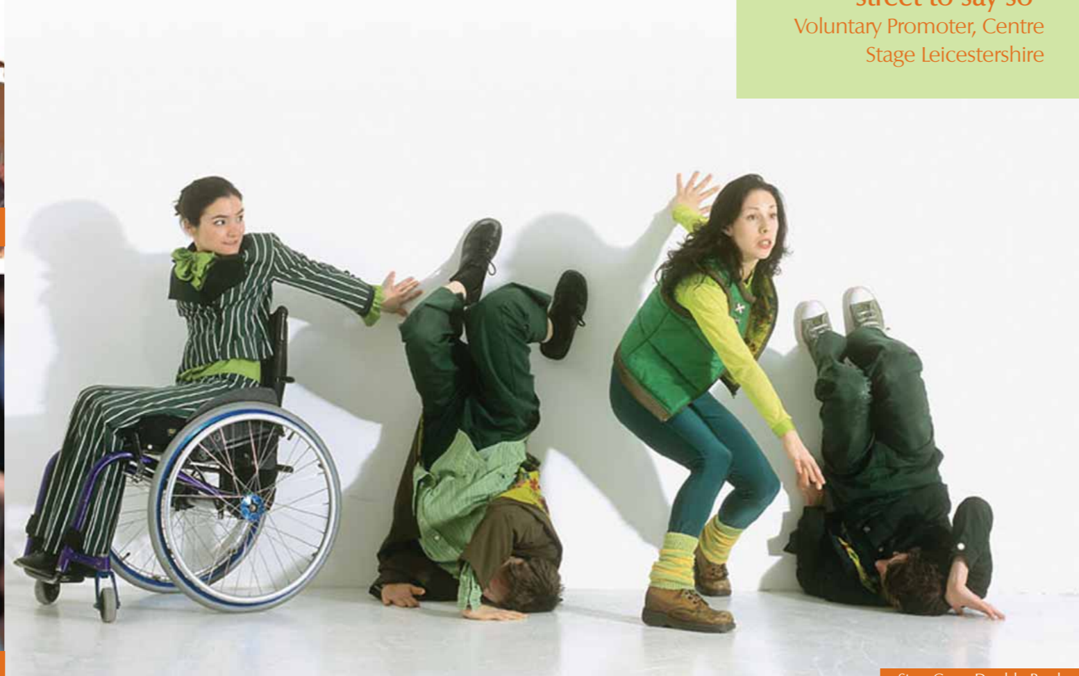
Stop Gap - Double Booked - Photo: Hugo Glendinning