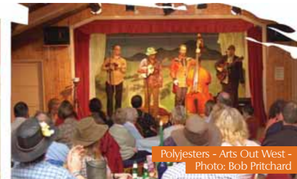
Polyjesters - Arts Out West