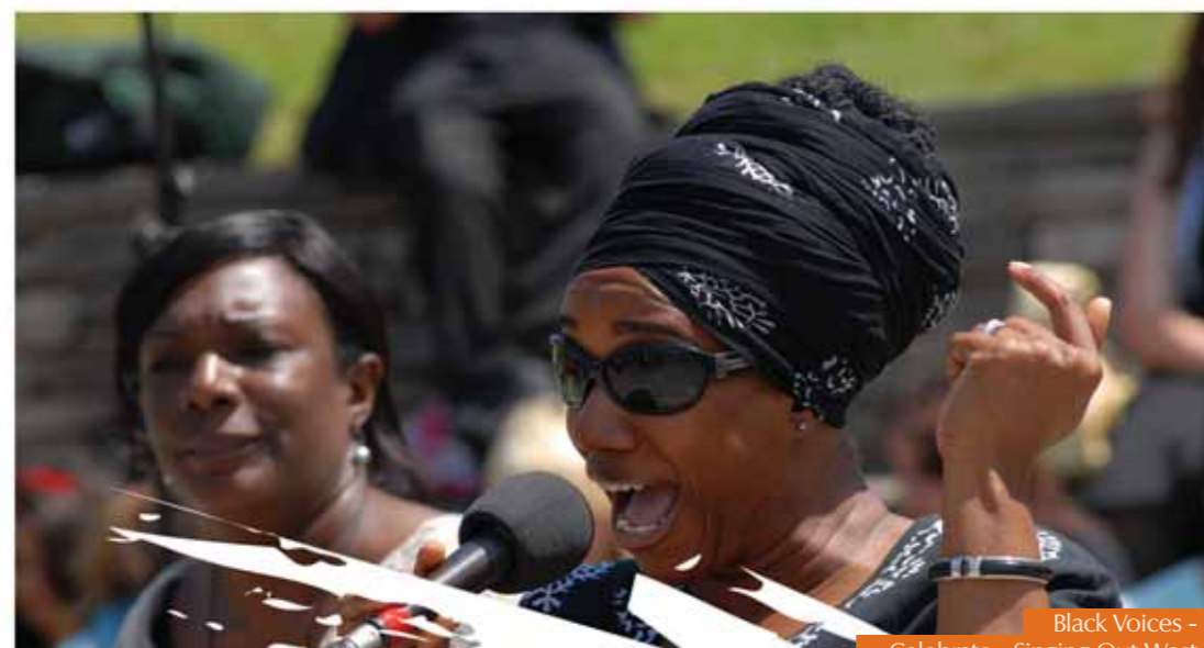
Black Voices - Celebrate - Singing Out West