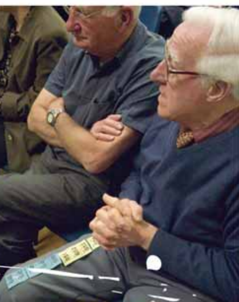
Take Art raffle - Photo: Mark Passmore