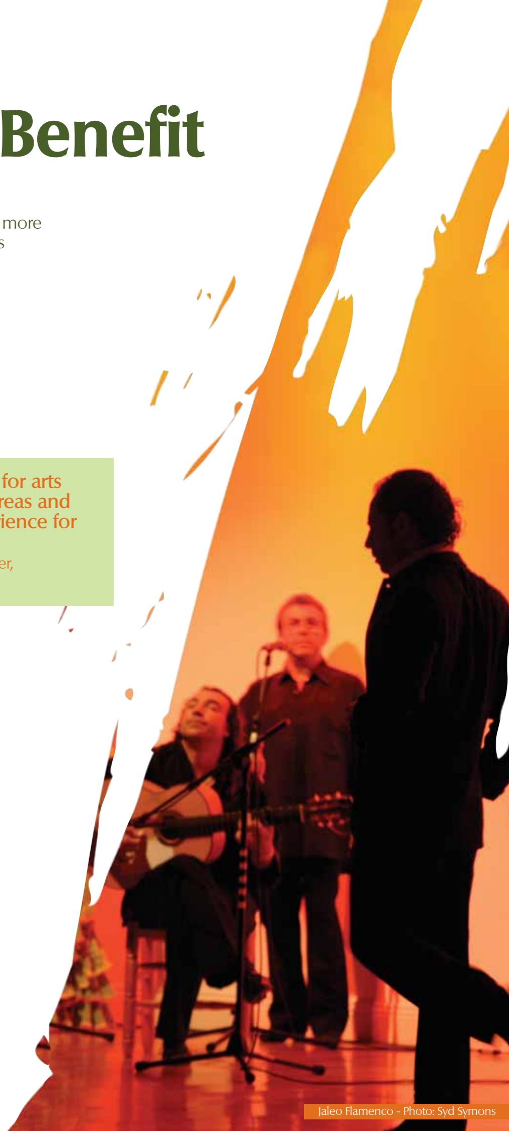
Jaleo Flamenco