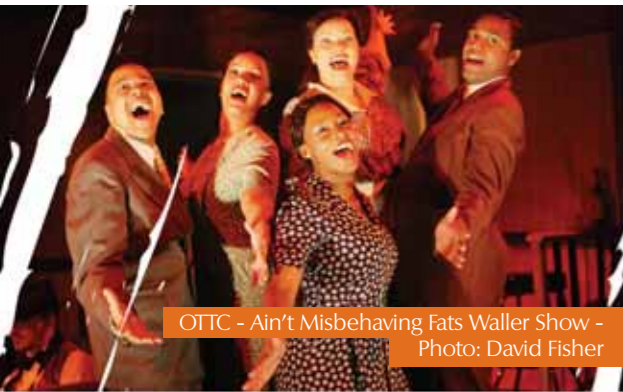
OITC - Ain't Misbehaving Fats Waller Show