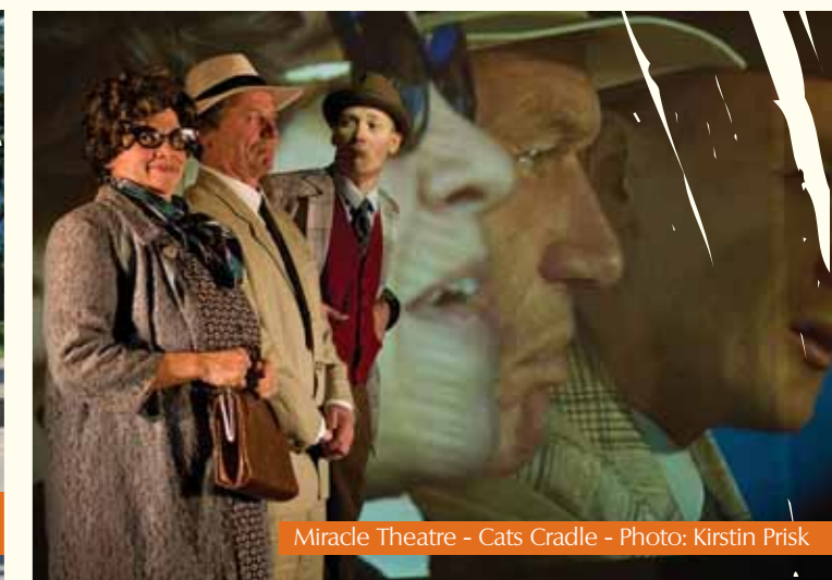
Miracle Theatre - Cats Cradle - Photo: Kirstin Prisk