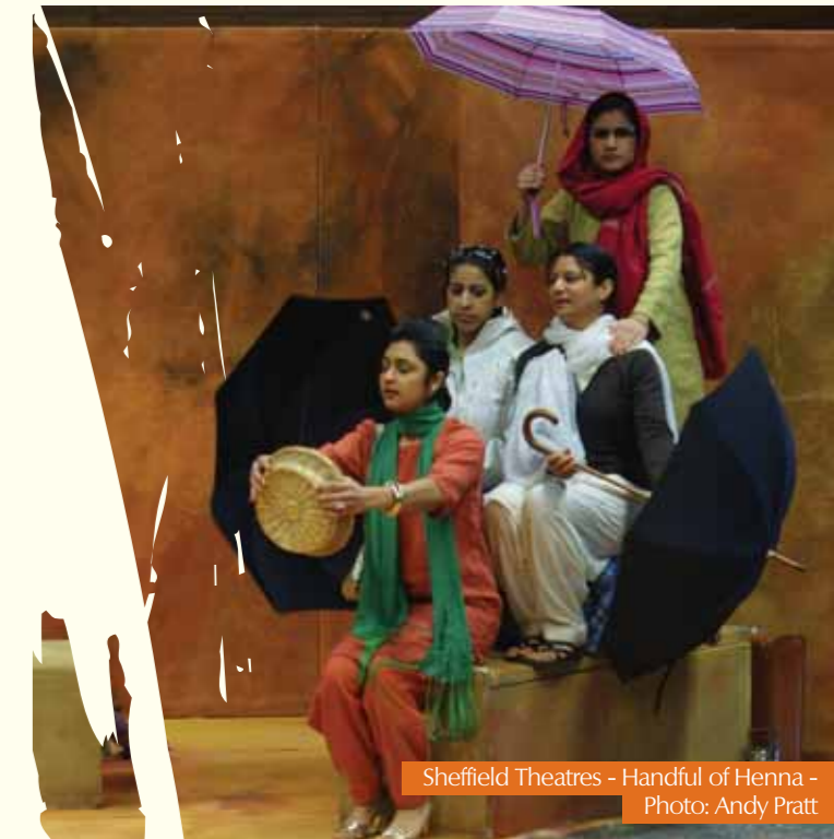
Sheffield Theatres - Handful of Henna

Future plans include extending early years touring, continuing with our international work and developing work with urban communities.