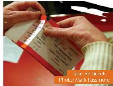
Take Art tickets